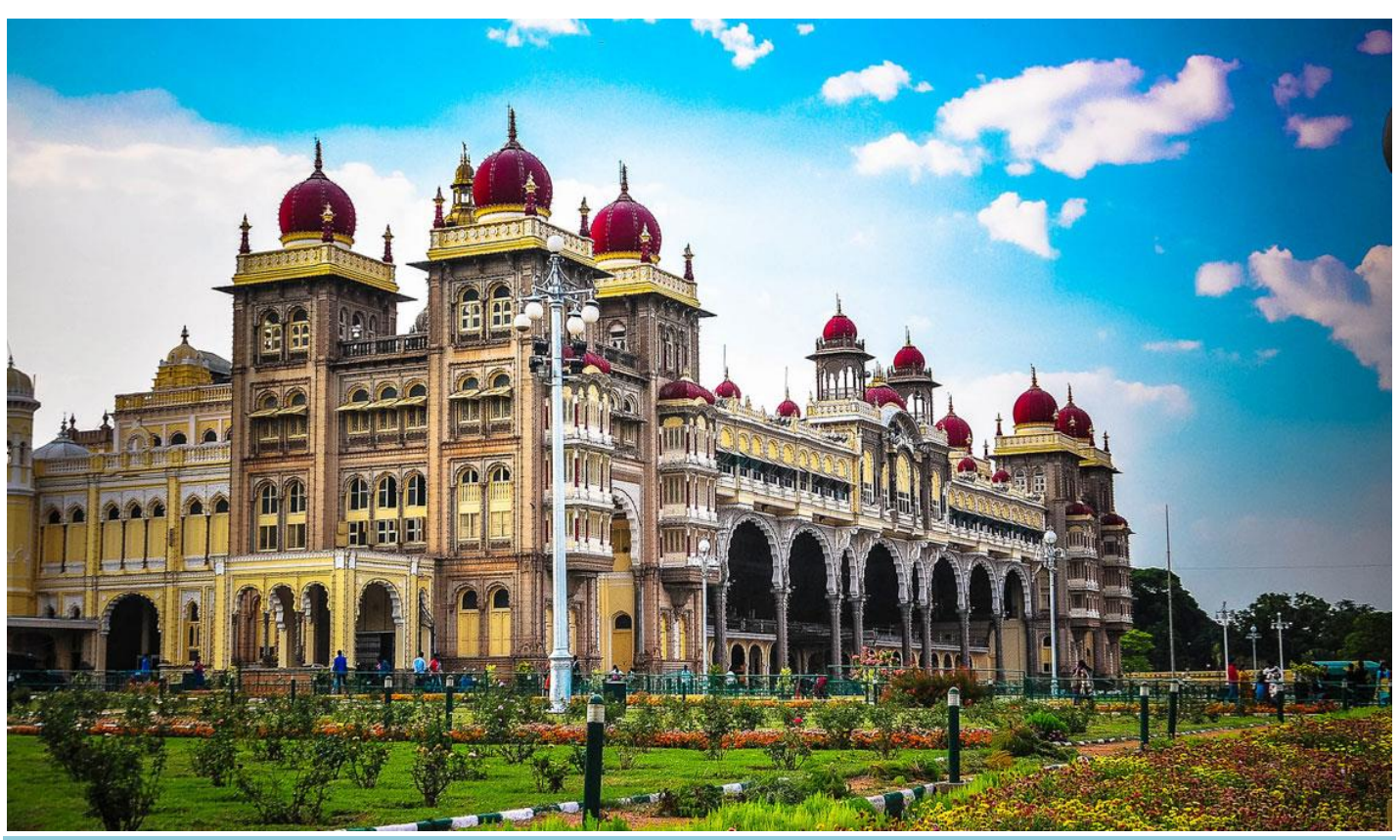
Greetings from WPS Holidays. It gives us immense pleasure to provide you with detailed itinerary and quote for your upcoming holiday to South India.